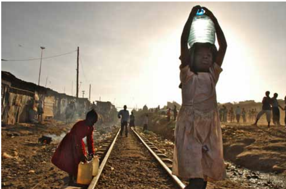
Jesuit high school photographers capture life in Kenya