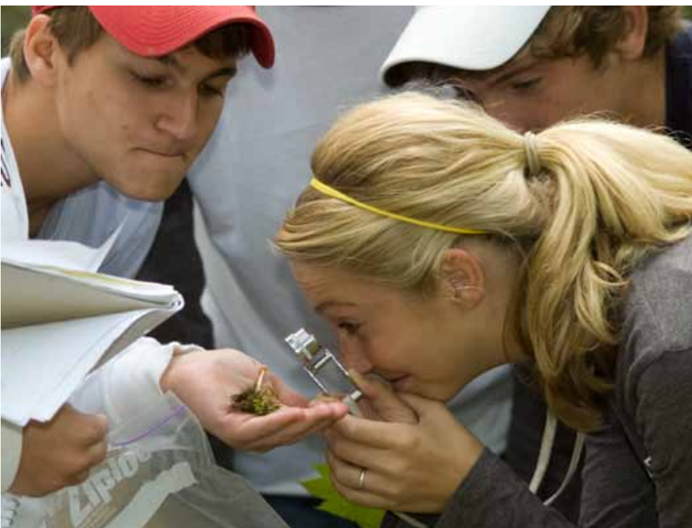
St. Ignatius College Prep (Chicago) seniors inspect a clump of moss at the Harms Woods Forest Preserve in Glenview, Illinois.