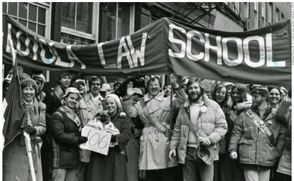
LOYOLA UNIVERSITY CHICAGO

Loyola University Chicago Law's class of 1979