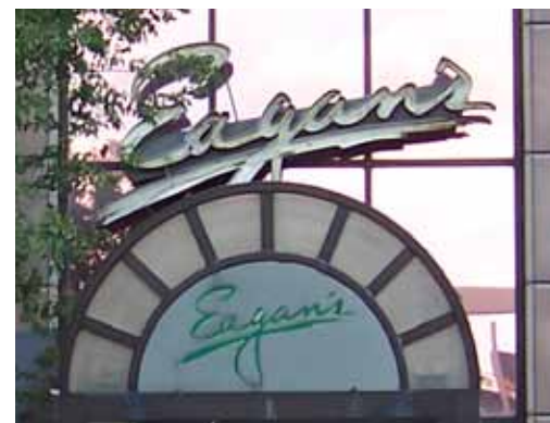
Milwaukee restaurant named after a Jesuit